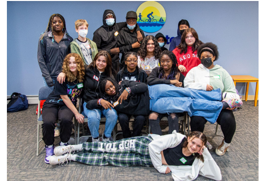
IDEA and SJA Retreats