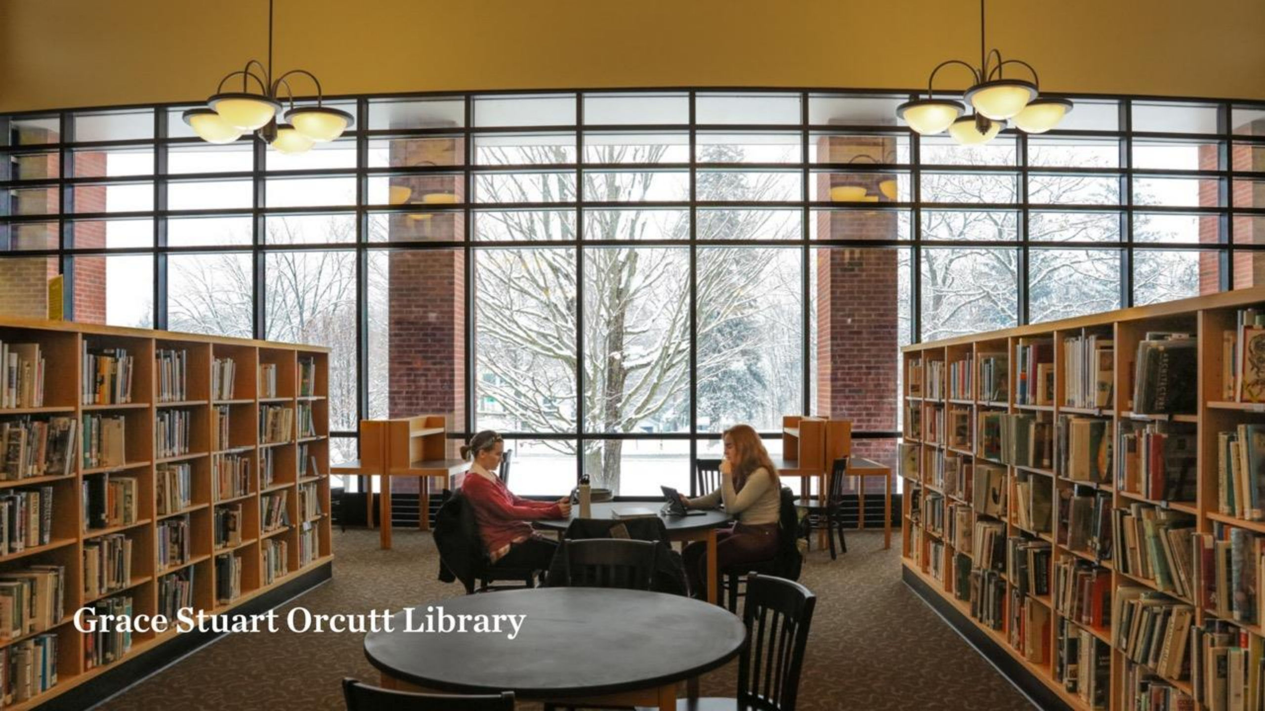
Grace Stuart Orcutt Library